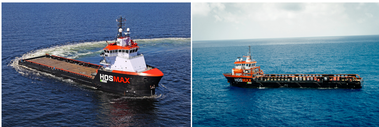
Two ultra high-spec HOSMAX OSVs

Vessels that do not carry at least a DP-2 notation or have less than 2,500 DWT capacity typically operate in more shallow U.S. waters or in foreign locations in which DP-2 has not yet emerged as the dominant standard. Currently, 18 of our vessels are low-spec, comprising 13% of our fleet by DWT. The remaining 87% of our fleet is considered high-spec, including roughly 60% of our overall fleet that is ultra high-spec.