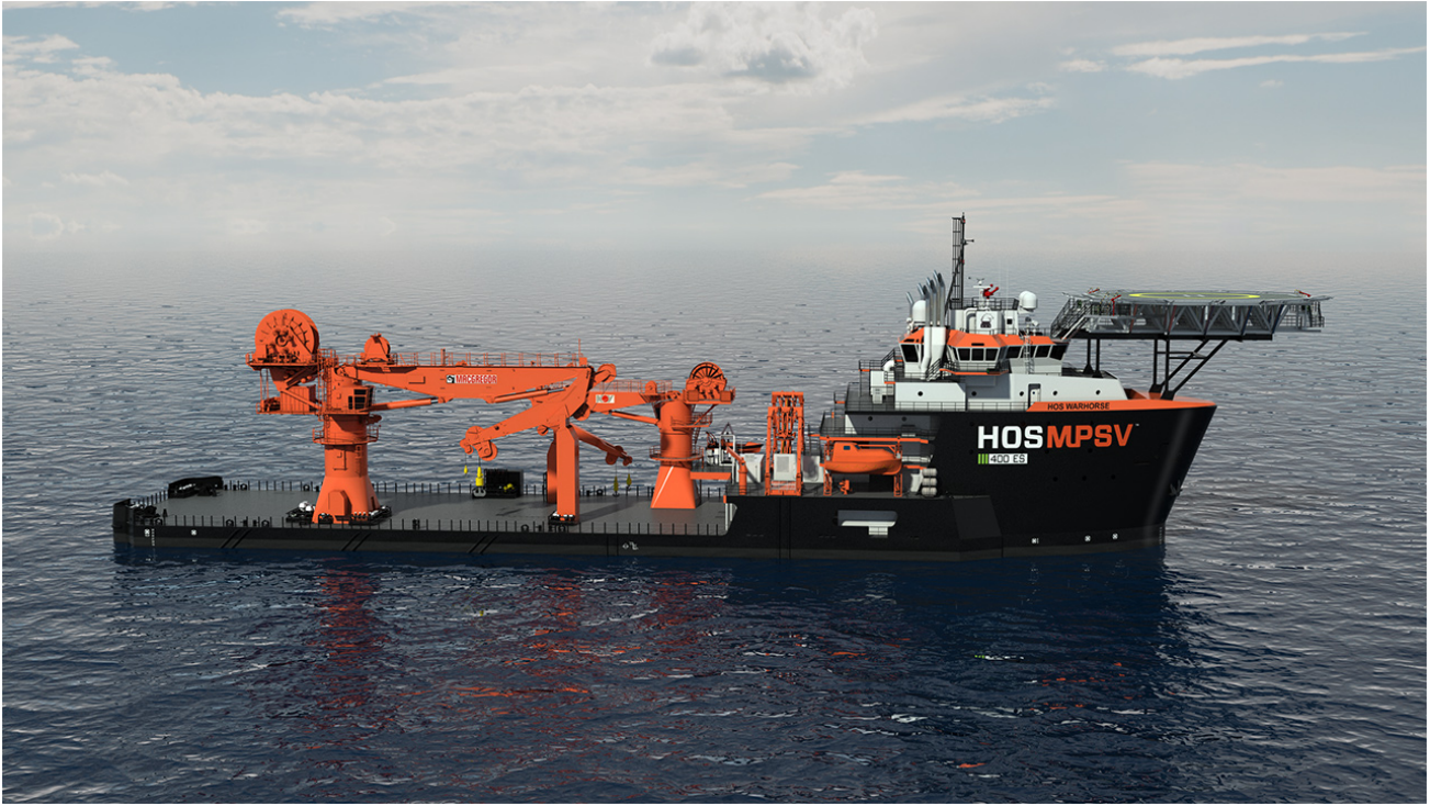
Rendering of Planned HOS 400' Class MPSV

In April 2015, we also outfitted one of our 310 class OSVs that was placed in service under our ongoing newbuild program as a 310 class MPSV in flotel configuration. This U.S.-flagged, Jones Act-qualified MPSV includes a 35-ton knuckle-boom crane, a motion-compensated gangway and accommodations for 194 persons. Being Jones Act-qualified gives it mission flexibility that foreign flag flotels lack in the GoM.