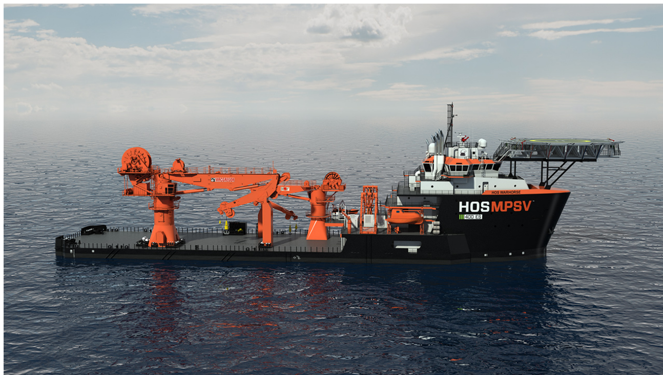
Rendering of Planned HOS 400' Class MPSV

In April 2015, we also outfitted one of our 310 class OSVs that was placed in service under our ongoing newbuild program as a 310 class MPSV in flotel configuration. This U.S.-flagged, Jones Act-qualified MPSV includes a 35-ton knuckle-boom crane, a motion-compensated gangway and accommodations for 194 persons. Being Jones Act-qualified gives it mission flexibility that foreign flag flotels lack in the GoM.